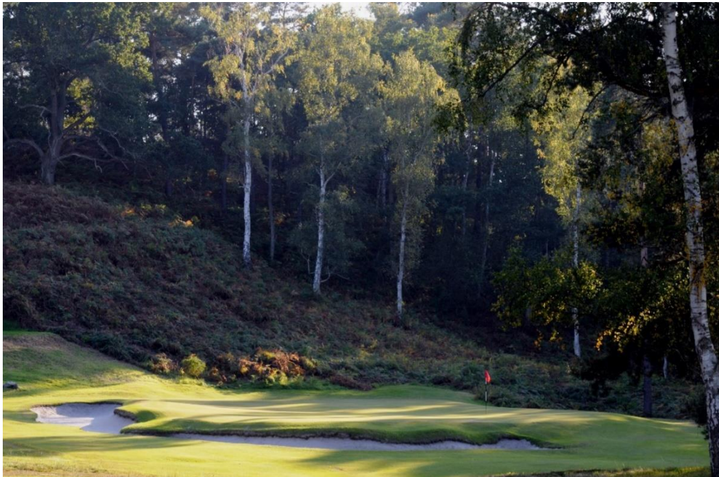
Morfontaine – Green 17