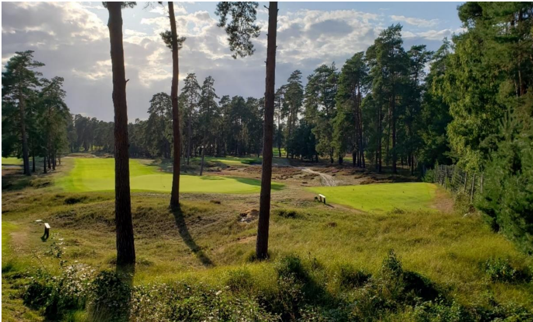
Morfontaine – Green 10 & Hole 11