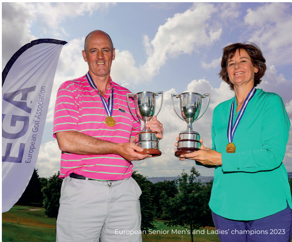
European Senior Men's and Ladies' champions 2023