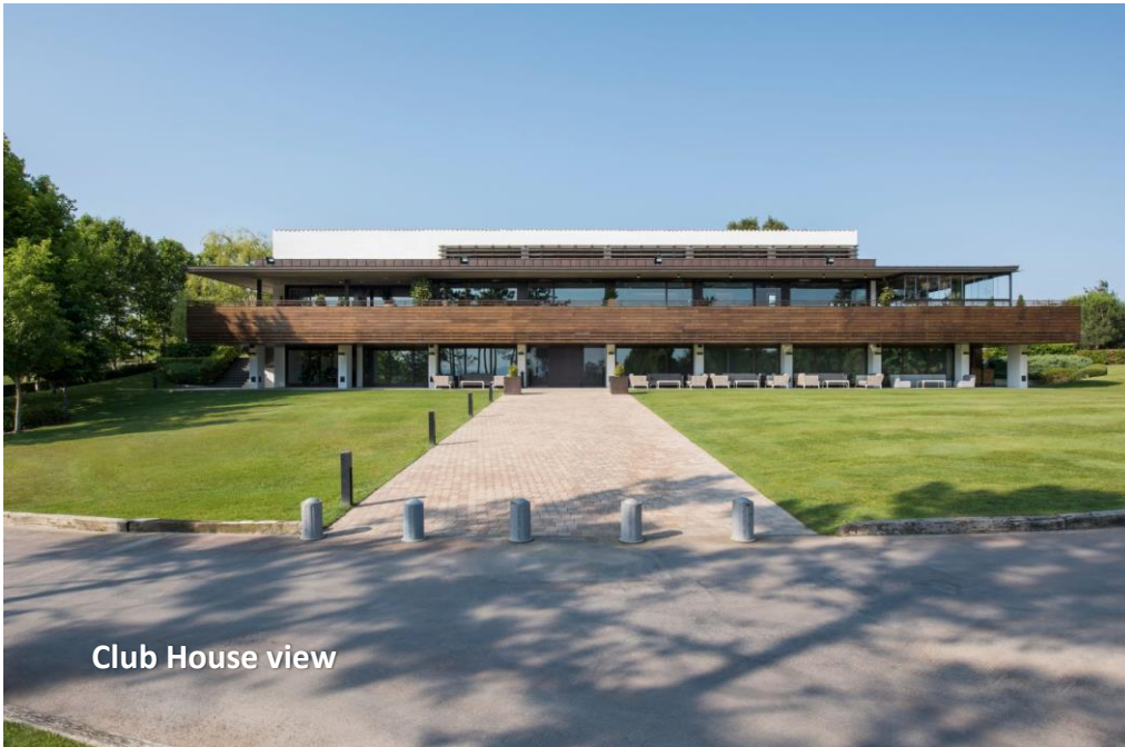
Club House view