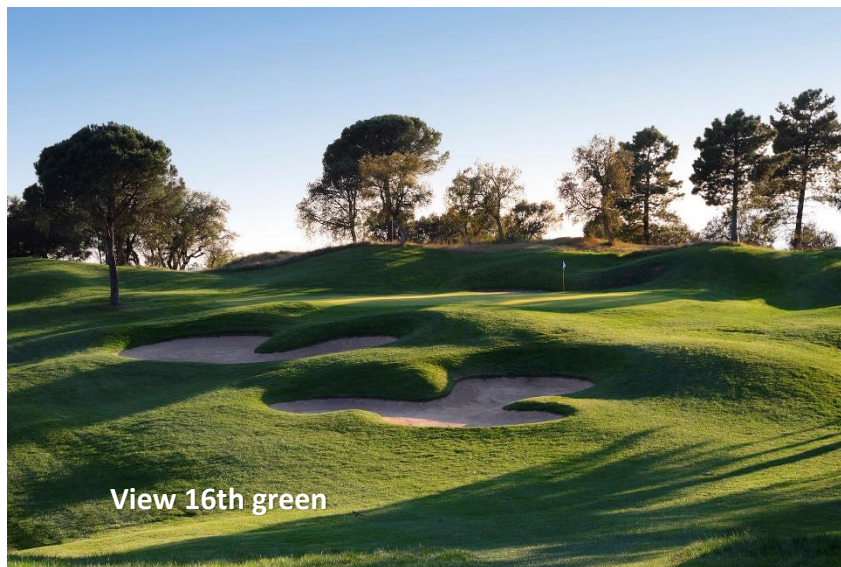
View 16th green