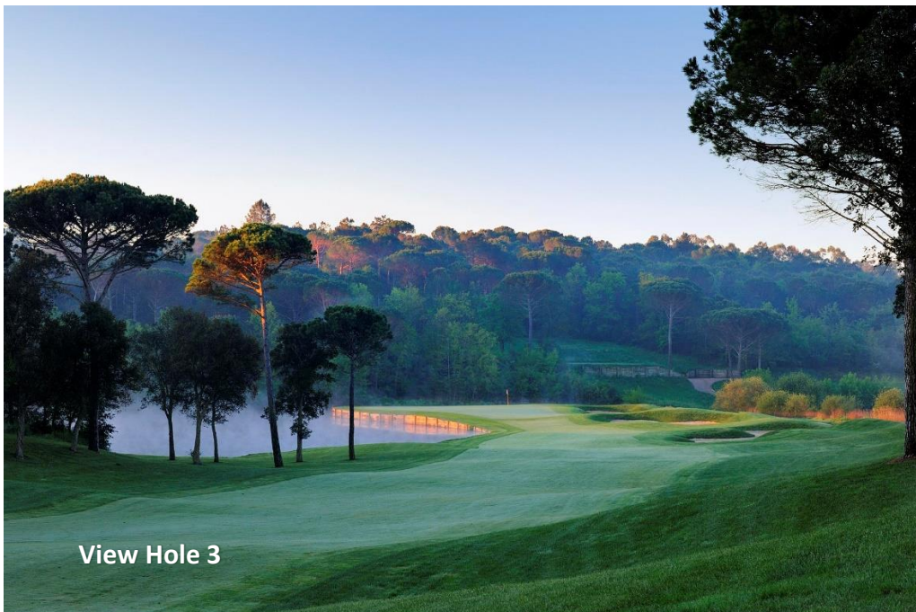
View Hole 3