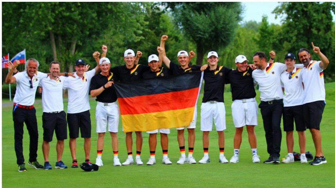
Germany defending champions.