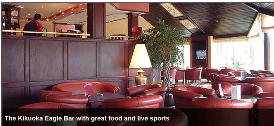
The Kikuoka Eagle Bar with great food and live sports