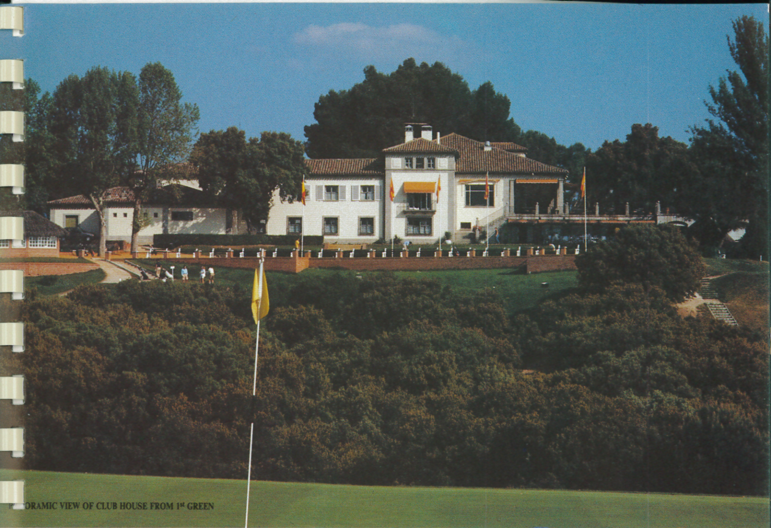
PANORAMIC VIEW OF CLUB HOUSE FROM 1 st GREEN